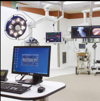
Signal Switching and Extension