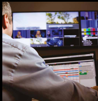
Video Switching and Extension