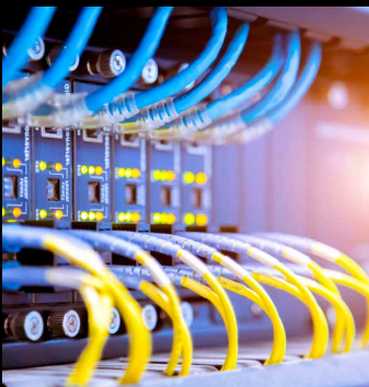
KVM Switching and Extension